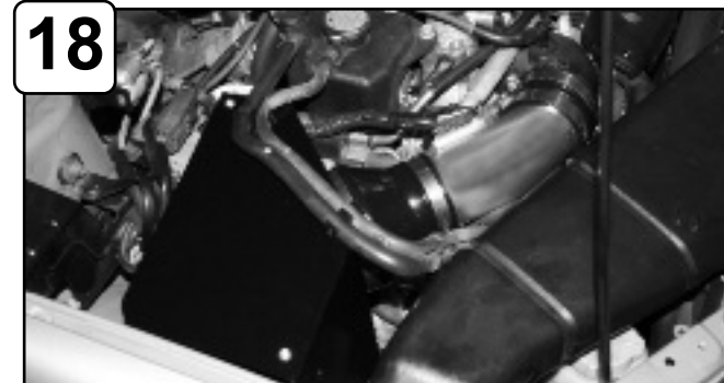
18 The installation of your Greddy Performance intake is now complete. Please check all components and re-tighten if necessary. Thank you for choosing Greddy!