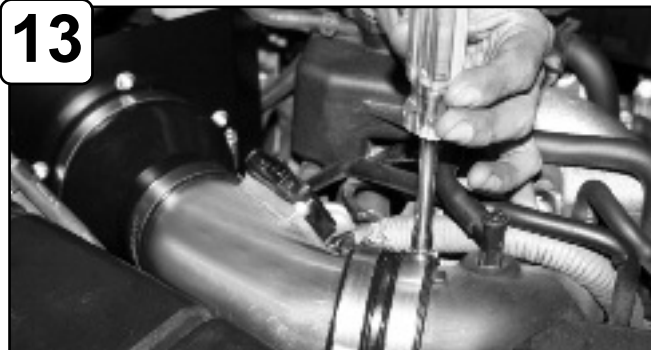
13 Tighten all clamps using 5/16" nut driver.