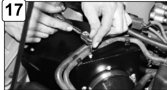
17 Install cover and tighten using 4mm allen key. Attach vacuum lines to cover tabs.