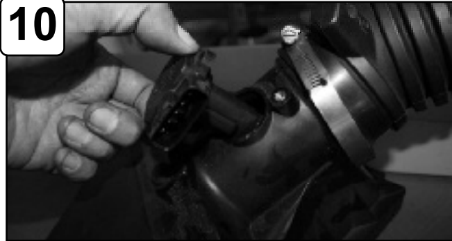
10 Remove MAF sensor from stock intake.

Greddy Performance Products 9 Vanderbilt, Irvine CA 92618 T: 949.588.8300 F: 949.588.6318 tech@greddy.com www.greddy.com