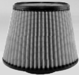
Replacement Filter P/N: 61-90133

Note: Filter Cleaning: When cleaning your Pro Dry S™ filter, be sure to use only "Restore Kit" (P/N: TP-7015C Pro Dry S™ cleaner only.)