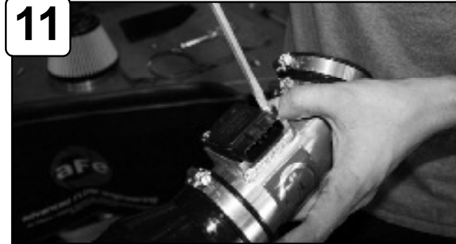
11 Install MAF sensor on intake tube using M4 screws provided. Attach couplers with clamps to intake tube.