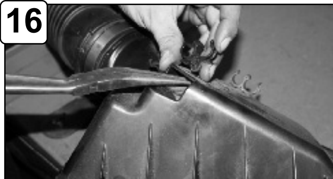
16 Remove clips from upper half of air box. Attach onto new cover.