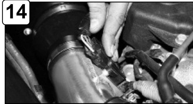
14 Re-connect MAF sensor harness.