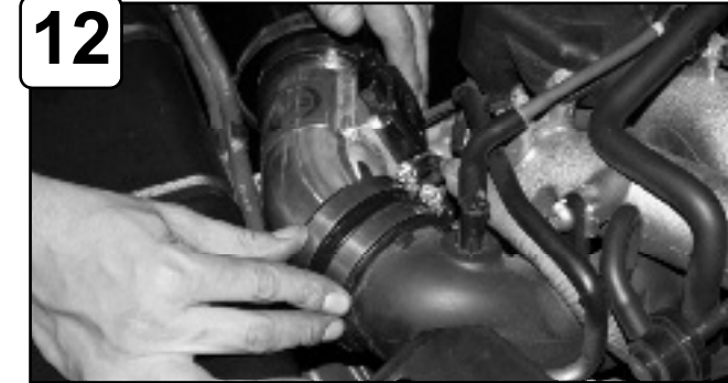
12 Install and position new tube to throttle body and filter adaptor.