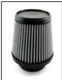
Pro DRY S Air Filter