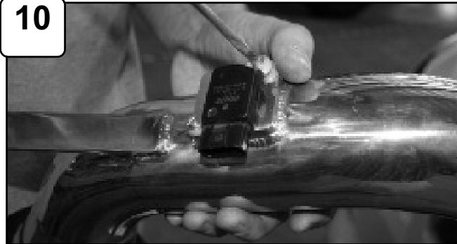
Install MAF sensor to intake tube using provided M4 screws.