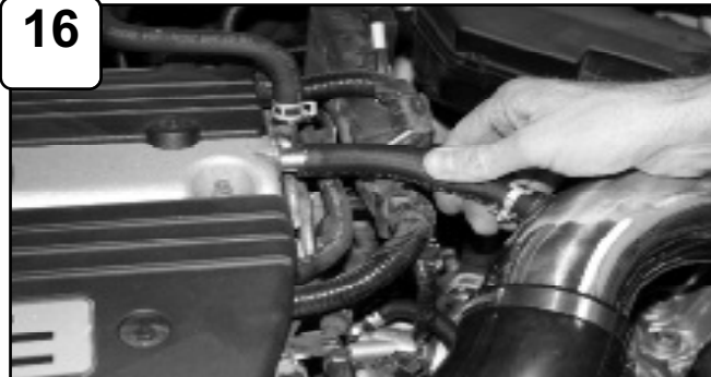
Install provided 5/8" hose to engine and tube. Re-connect MAF sensor harness and battery terminals.