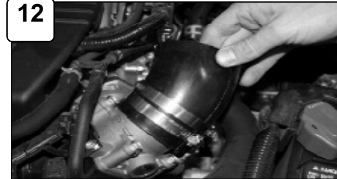
Install elbow coupler to throttle body and position using clamps provided. Do not tighten.