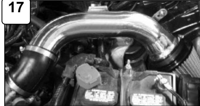
The installation of your Greddy Performance intake is now complete. Please check all components and re-tighten if necessary. Thank you for choosing Greddy!