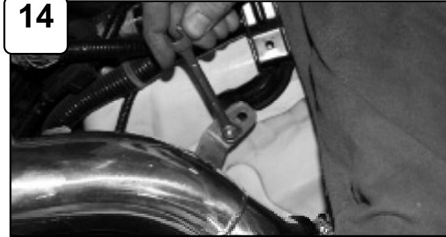
Using isolation mount provided, secure to vehicle and position tab on tube to isolation mount. Tighten using the washer and nut provided with 10mm socket or wrench.