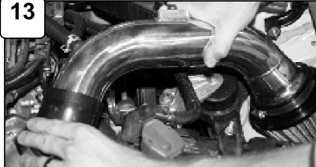
Install intake tube assembly into vehicle and position.