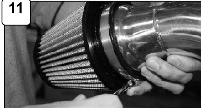
Install air filter to intake tube and tighten using 5/16" nut driver.