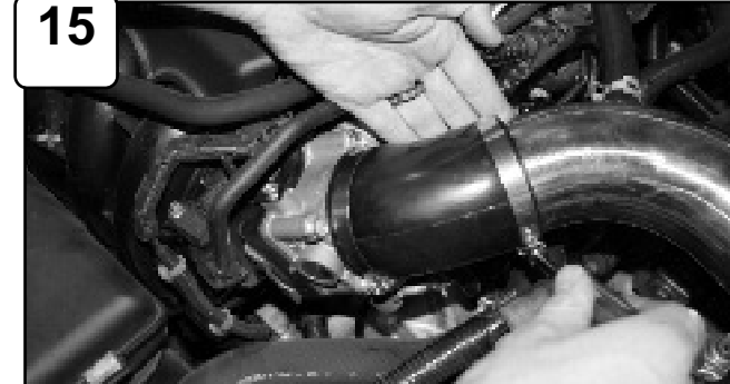
Position and tighten clamps on tube using 5/16" nut driver.