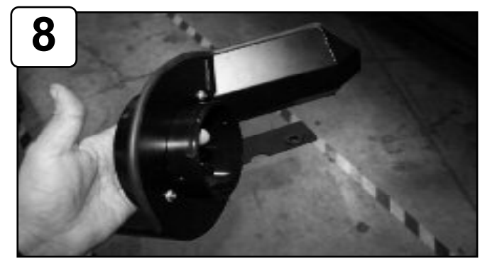
Install filter adaptor to housing and secure using button head screws provided. Tighten using 4mm allen key. Attach rubber trim to top of housing.