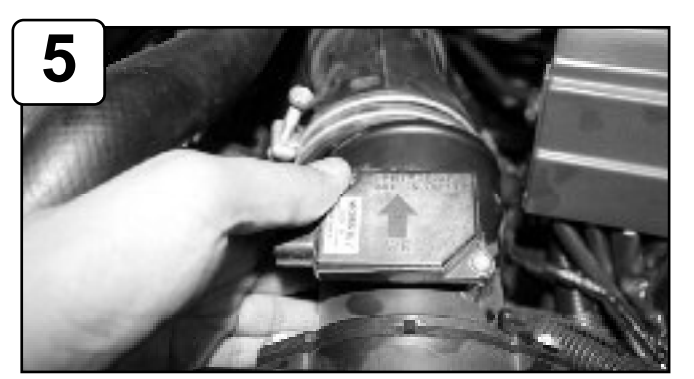
Pull back MAF sensor from intake tube.