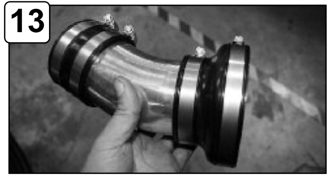
Attach couplers with clamps to intake tube.