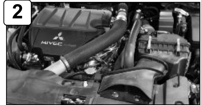
Complete Stock intake. Please disconnect battery terminals before installation.