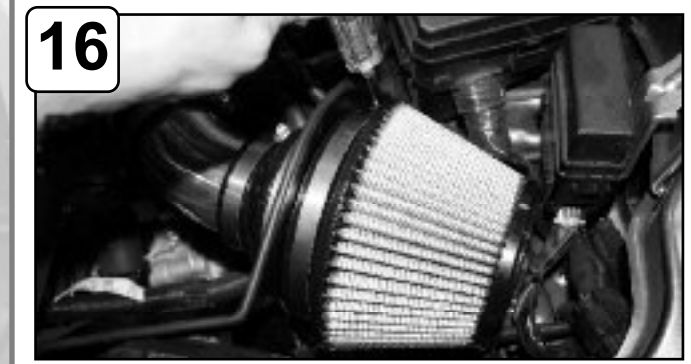
Install air filter and tighten using 5/16" nut driver.