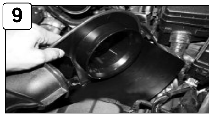
Install housing into vehicle and position.