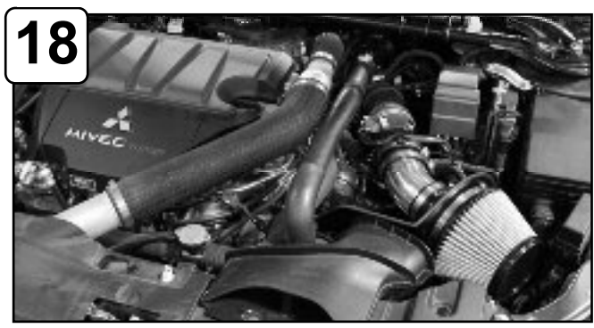
The installation of your Greddy Performance intake is now complete. Please check all components and retighten if necessary. Thank you for choosing Greddy!

Note: Filter Cleaning: When cleaning your Pro Dry 5 ™ filter, be sure to use only "Restore Kit" (P/N: TP-7015C Pro Dry 5 ™ cleaner only.)