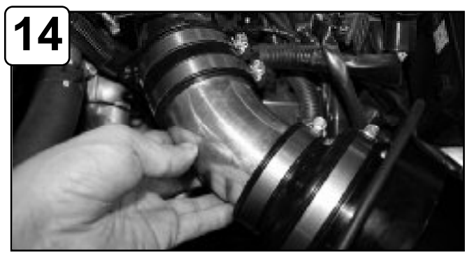
Install and position intake tube assembly to MAF sensor and adaptor.