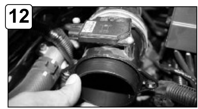
Install MAF sensor back to intake tube.