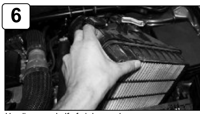
Un-clip upper half of air box and remove.