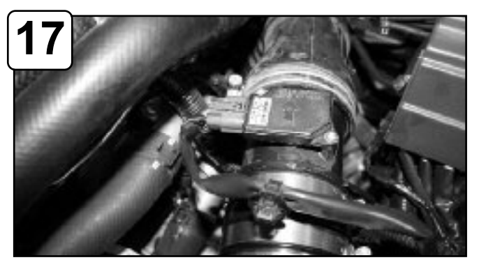
Re-connect MAF sensor harness. Tighten intake clamp using 10mm socket or wrench.