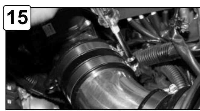
Tighten clamps using 5/16" nut driver.