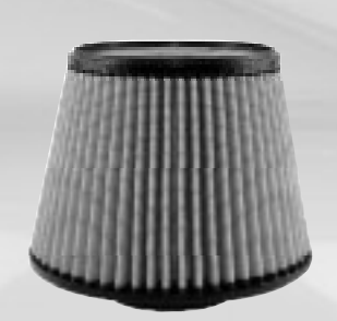
Replacement Filter P/N: 61-90133