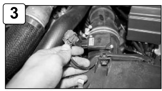
Disconnect MAF sensor harness. Loosen clamp using 10mm socket or wrench.